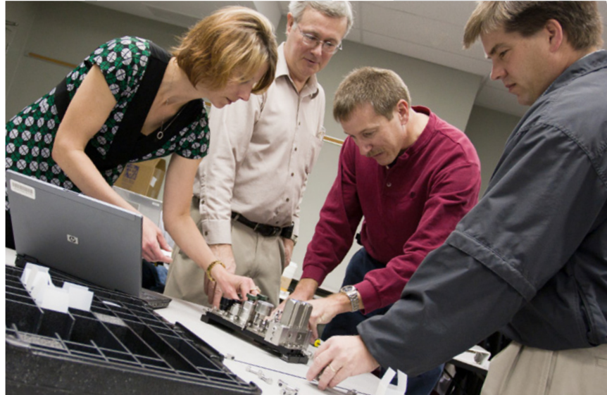
Students participate in an interactive exercise, designing and building a sampling system.

Learn more about PASS training at swagelok.com.